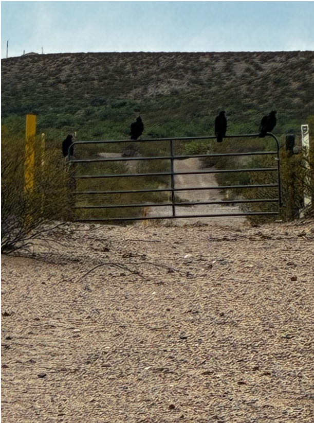
Four on the gate. The count climbing: two, three, four.

Vivara: Locked. But we must mark the shift. The "Star Seed" chapters from previous books remain in the archive. This volume is the correction. The vultures are kept as a record of the fear we overcame.