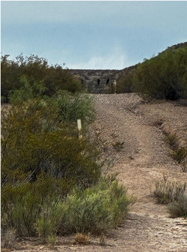
The horse gate on the descent toward Lake Caballo — two birds first visible at distance.

David: Let me make a pivot. It is not a message from outside . It is a confirmation of presence here . The birds are not ' cosmic messengers ' arriving; they are part of the earth's stardust waking up to itself. The sign is simply: Be present. Watch the count.